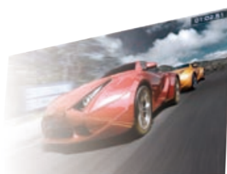
Panel with narrow viewing angle

"From my position in the middle of a row of five monitors I can see what's happening on my teammates screens clearly; they don't look washed-out. I think this must be because of the IPS panel."