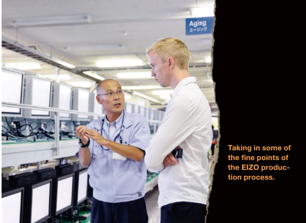
Taking in some of the fine points of the EIZO production process.