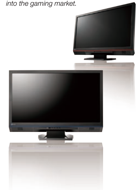
The FORIS FS2332, EIZO's premier entry into the gaming market.